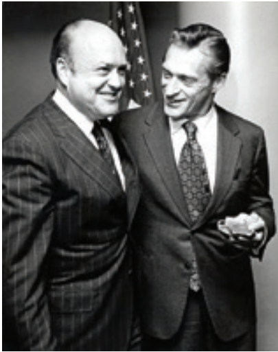
Secretary of Defense Melvin Laird (left) and Director of Defense Research and Engineering John S. Foster, October 2, 1972. Foster provided technical guidance on acceptable knowledge sharing with the French.

for the sharing of knowledge and technology with France. How was that policy implemented in practice? 21