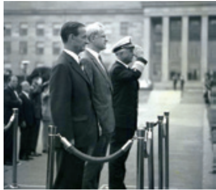
A ceremony at the Pentagon on September 25, 1973. French Defense Minister Robert Galley (left) had secretly negotiated earlier with National Security Adviser Henry Kissinger and Secretary of Defense James Schlesinger (center) for technical nuclear support for France. They are accompanied by the Chairman of the Joint Chiefs of Staff Thomas Moore.