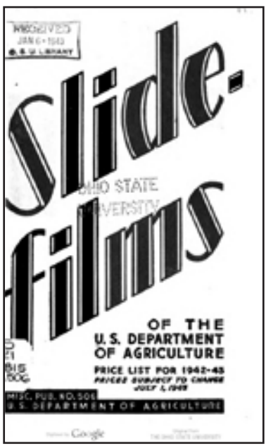
During World War II, the USDA produced two films specifically addressing farm women's wartime roles.

In the postwar years, the USDA continued to emphasize farm women's important labors as the purveyors of food preservation and security, but they also turned to harnessing women's interests outside of their individual and familiar rural environments. In the 1948 "Annual Reports of the Department of Agriculture," the USDA noted that farm women understood that broadening their horizons was an important element of their domestic and farm labors. "Greater interest," according to the report, "is being shown in what goes on in local and state government activities and international affairs." In at least one example, Illinois farm women asserted that "Home is the Center of a Woman's Life, Not Its Circumference."37 Farm and rural women