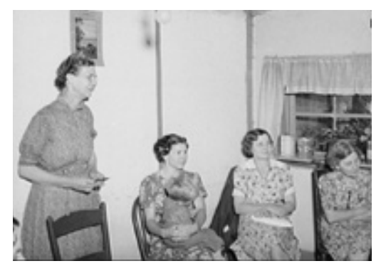
Farm women often held meetings with Extension Service workers to discuss family and community concerns.

But what did these changes mean for farm women? It meant the formulation of closer working relationships with state agricultural specialists who developed projects, guided by USDA directives for farm women, on such topics as poultry, gardening, and "home engineering," tasks informed by contemporary understandings of gendered