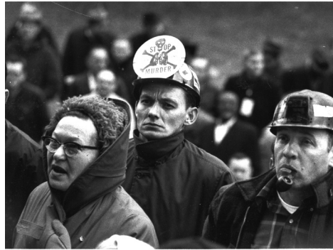
A group of miners at a rally in Charleston, West Virginia, in 1969 for passage of a mine safety act. The horrific mid-November 1968 explosion at the Consolidation Coal Company's No. 9 mine in Farmington, West Virginia, focused the nation's attention on coal mine health and safety.

On January 11, 1971, about 50 coal miners in Logan County, West Virginia, marched in protest at the Social Security Administration's (SSA) mismanagement of a new federal compensation program for the victims of pneumoconiosis. 1 Also known as "black lung," pneumoconiosis was a debilitating, work-related respiratory disease caused by the inhalation of coal dust. The compensation program was part of the Federal Coal Mine Health and Safety Act, which was passed by Congress and signed into law by President Richard Nixon in December 1969. In administering the program, the SSA had denied the claims of thousands of disabled miners. Every miner applying for compensation had to undergo rigorous and extensive medical examinations, and the SSA used the results from those examinations to argue that many of the applicants did not have black lung, even when they displayed visible signs of breathlessness or respiratory impairment.