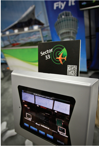
Smart Skies air traffic simulator.

dreams.” 95 The partnership’s first major activity was an air traffic control simulation software package called “Smart Skies,” for fifth- through ninth-grade students. Developed by NASA and FAA air traffic controllers at the Oakland air route traffic control center, Smart Skies used air traffic simulation to teach abstract thought and algebraic skills. To ensure that the FAA-cosponsored ACE academies met STEM mandates, in 2007 the FAA issued a new “ACE Academy Director’s Guide.” The guide addressed STEM needs by providing examples of aerospace thematic STEM curriculum and mandating its use as a requirement for FAA cosponsorship. 96