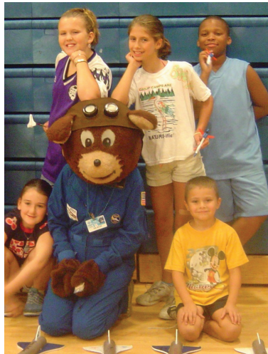
Air Bear and children

For over 75 years, often with limited or no resources and changing mandates from agency executives, program specialists and agency volunteers have continued to encourage students at all levels to study math, science, technology, engineering, and a host of other disciplines through a variety of innovative programs and partnerships. Although the FAA’s efforts were not always the structured educational activities undertaken in the early years, the agency continued to teach millions of children and young adults about the myriad jobs available in the aerospace industry and the educational experience necessary to obtain and succeed at those jobs. The program has evolved from one dedicated to help train pilots for military service in World War II, to a public affairs program aimed at improving public perception of the agency, to a pilot program to train college students for hard-to-fill aviation jobs, and finally to a program to encourage middle and high school students to study science and math.