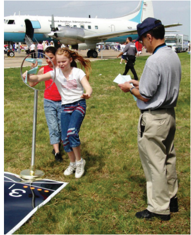
An FAA volunteer oversees “flight tests” at an education event.

On January 12, 2005, the FAA renamed its aviation education program as the Aviation and Space Education Program (AVSED). The newly named program expanded upon earlier program goals that were aimed to encourage students to explore aerospace careers; promote the skills and knowledge necessary for aviation careers; emphasize the FAA’s responsiveness to national and aviation challenges; increase awareness and understanding of the agency’s role in the aviation and aerospace communities; and promote the role of commercial space transportation. 91 By adding commercial space transportation to the aviation education mission, the FAA acknowledged the long-term, ongoing education activities of its Office of Commercial Space Transportation, which had been working with students to explore the connection between math, science, and technology. 92